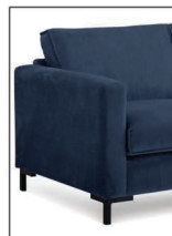
Arm - 11cm

3 seater Art. No.: 16405 Dimensions: H83 x D89 x W218cm